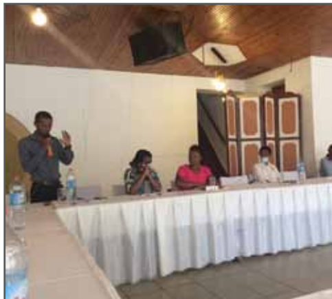
Below: participants in the February 19th meeting at Tombontsoa.