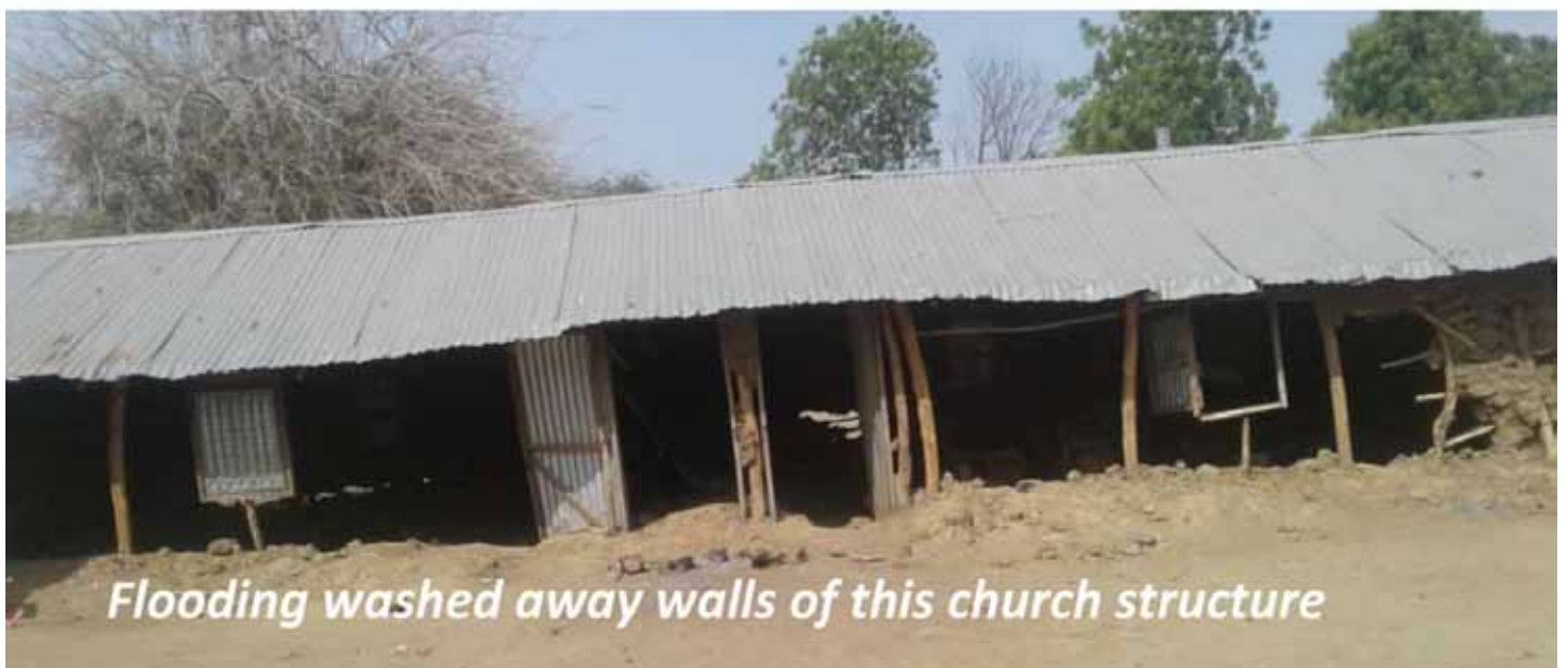
Flooding washed away walls of this church structure