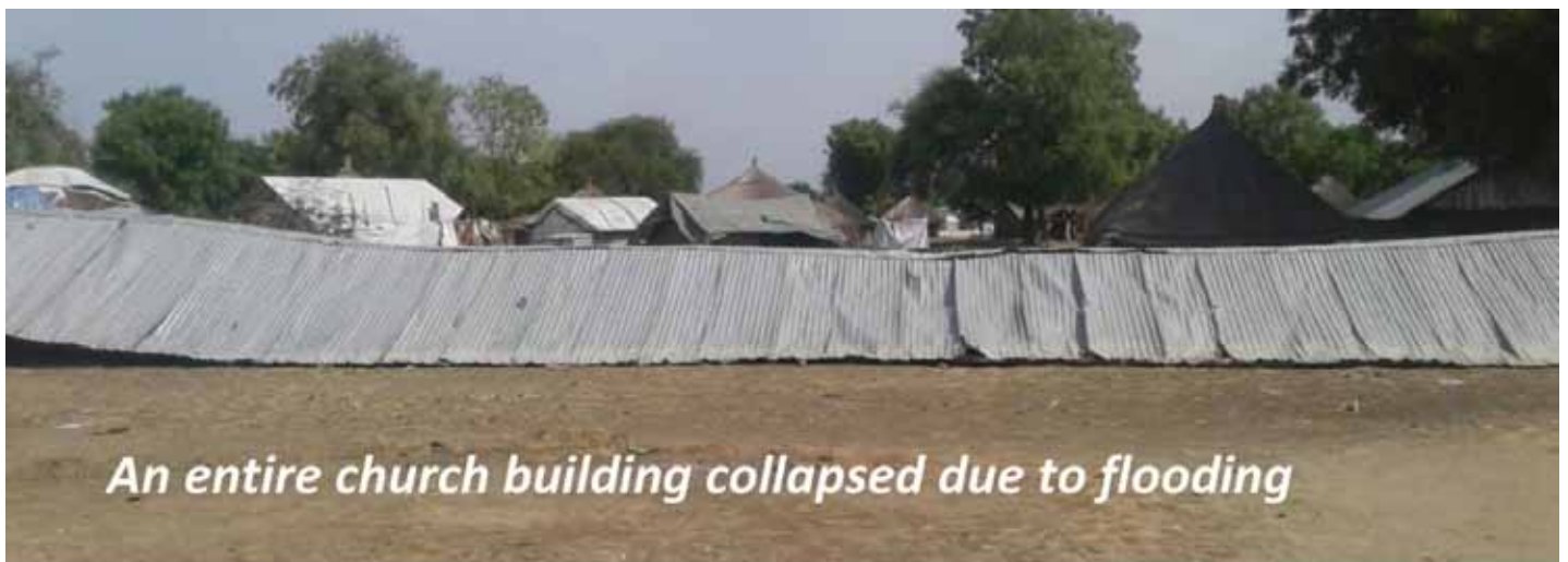
An entire church building collapsed due to flooding

Please read the complete letter from Rev. Bol, which explains the situation in detail and includes a list of specific needs for the SSELc. Gifts for the SSELc flood recovery effort can be sent to the Mid-South District (1675 Wynne Road / Cordova, TN 38016), designated for "SSELc Flood Recovery."