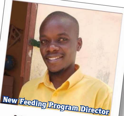
New Feeding Program Director

Without your donation, this would not be possible. We are so grateful that we get to serve Christ alongside you!