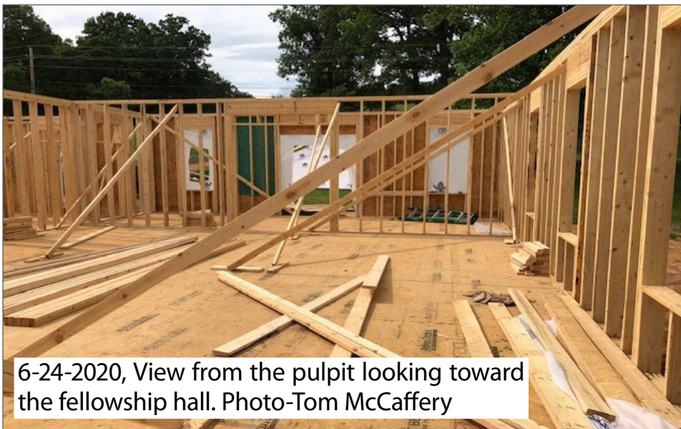
6-24-2020, View from the pulpit looking toward the fellowship hall.