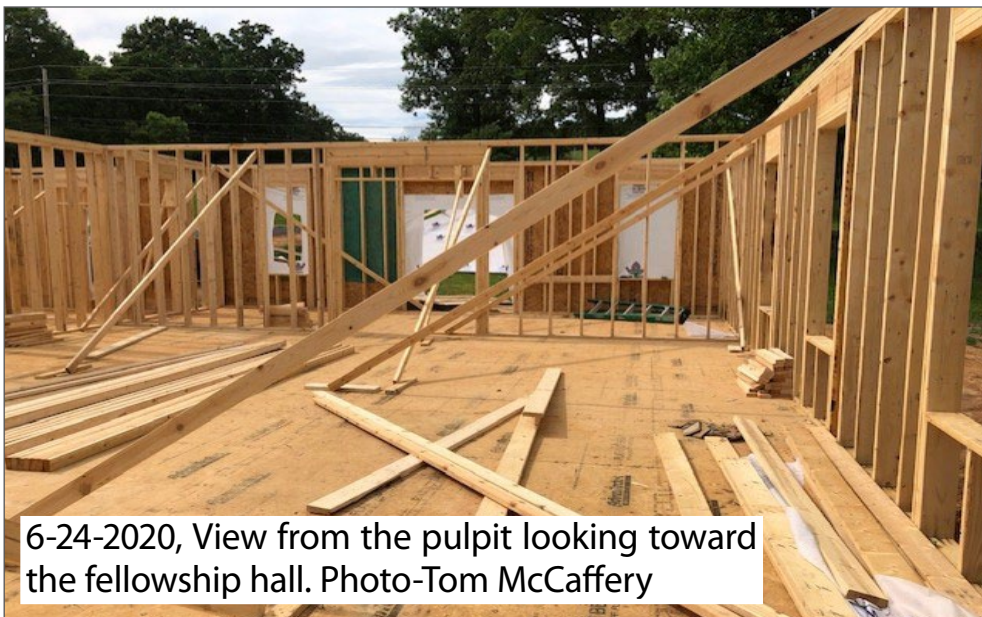
6-24-2020, View from the pulpit looking toward the fellowship hall.

While waiting for their building to be completed, the church continues to hold Sunday worship services at 10:30 am on Zoom.