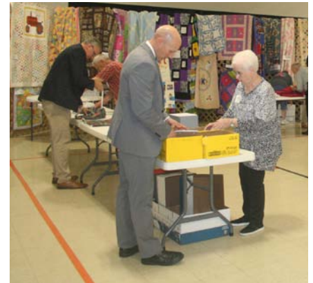
Conference group assembling over 90 School kits for the CARE-VAN project for Lutheran World Relief