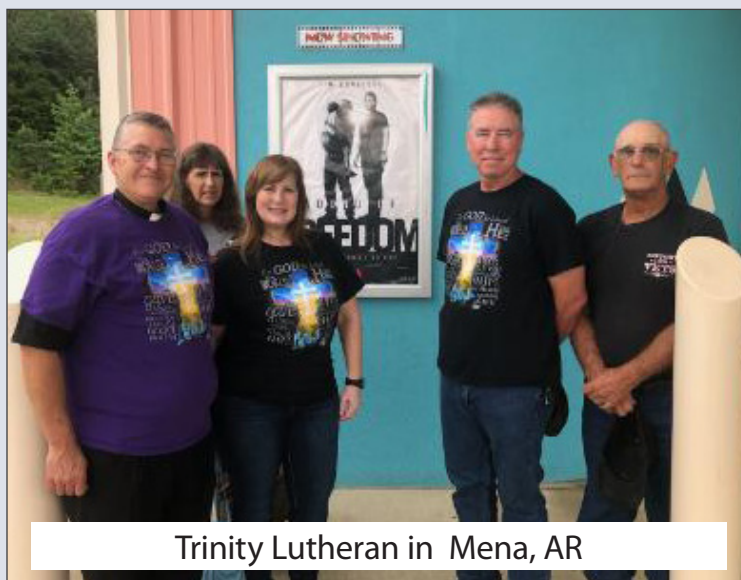
Trinity Lutheran in Mena, AR

The Mid-South District was pleased to make this opportunity available as an encouragement for Lutherans to see this important film. For those who have not been able to see the film in theaters, it will be available for streaming on the Angel Studios app this fall.