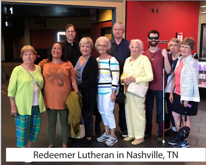
Redeemer Lutheran in Nashville, TN