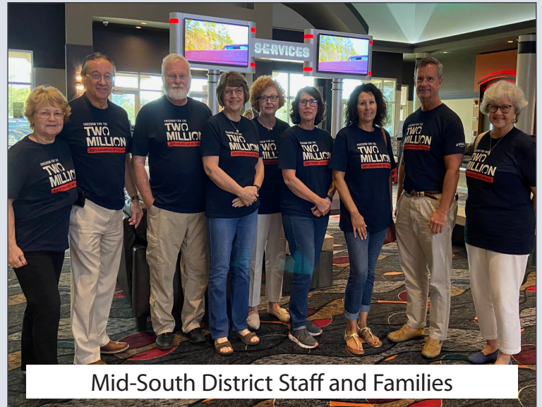
Mid-South District Staff and Families