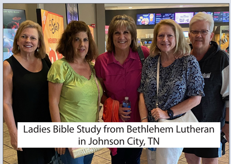
Ladies Bible Study from Bethlehem Lutheran in Johnson City, TN