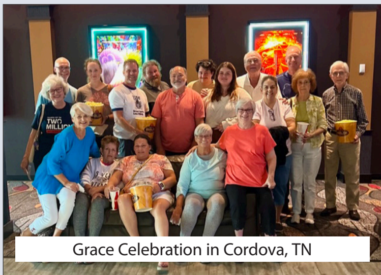
Grace Celebration in Cordova, TN