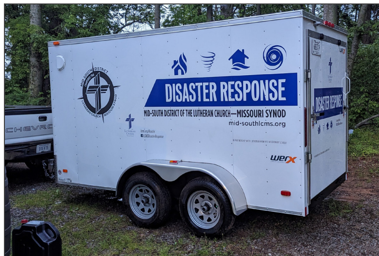
The team recently received a disaster response trailer from the Mid-South District, which was previously donated by Christ the King Lutheran Church & School in Memphis after several years of use.