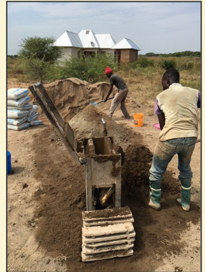
(L and R) Making bricks