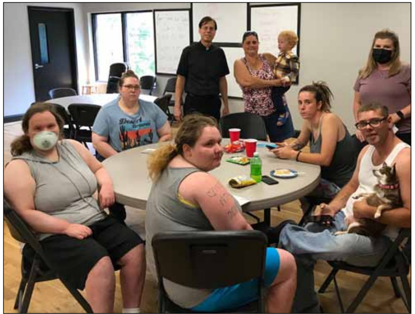
Families that received aid at the First Baptist Operation