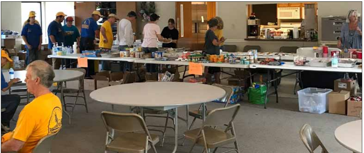
First Baptist Operation