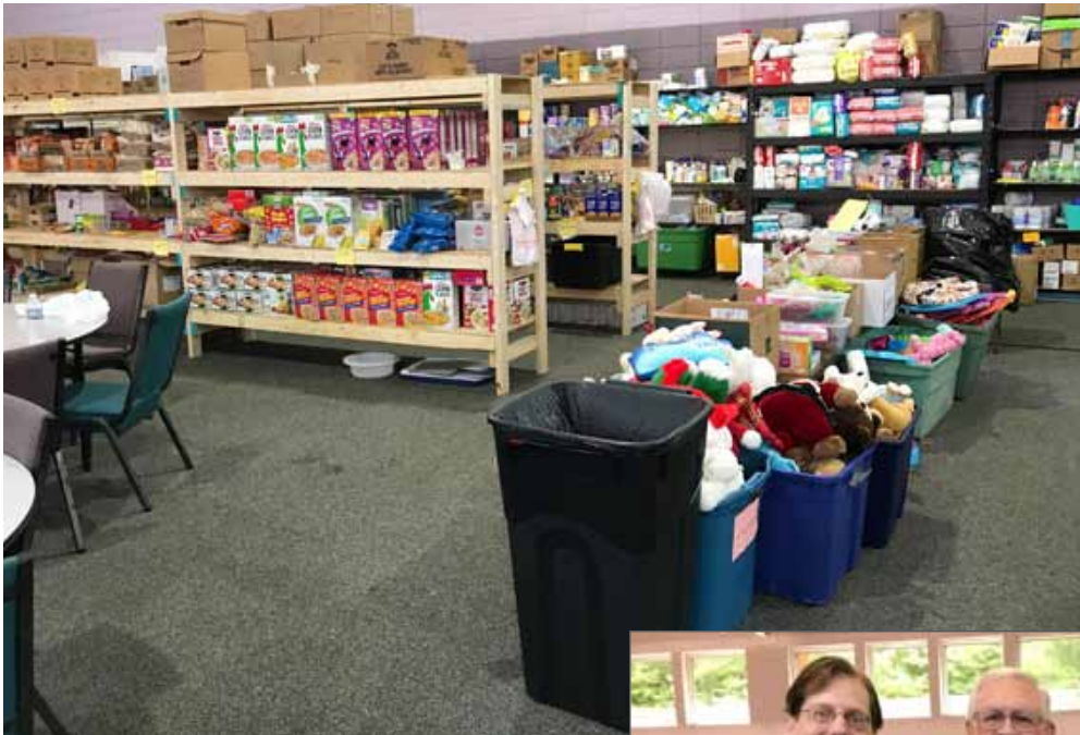
Waverly Church of Christ Operation (above and right)