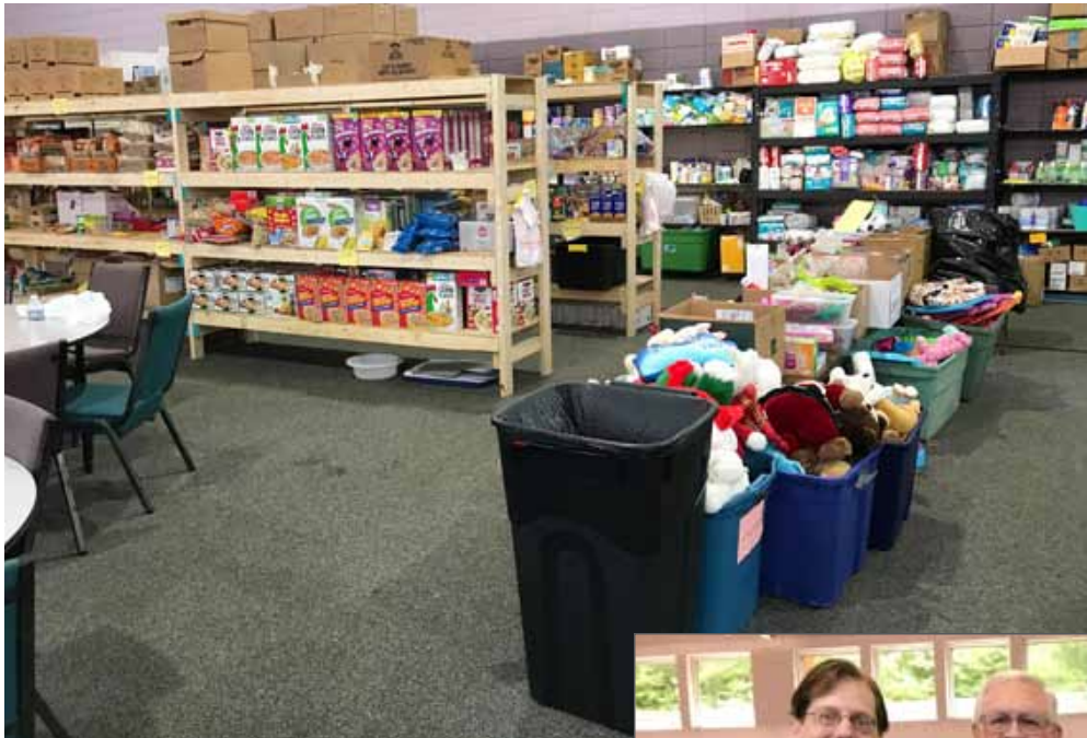
Waverly Church of Christ Operation (above and right)