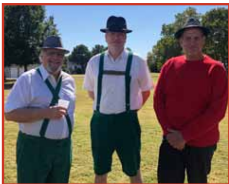
Some guests really got into the Oktoberfest spirit!