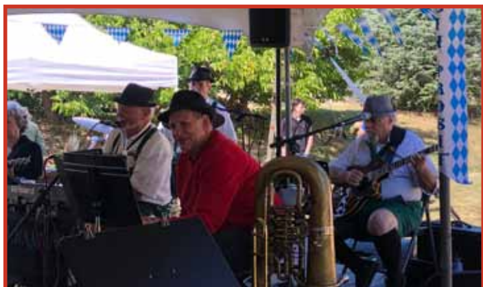
You can't have Oktoberfest without an Oompah band!