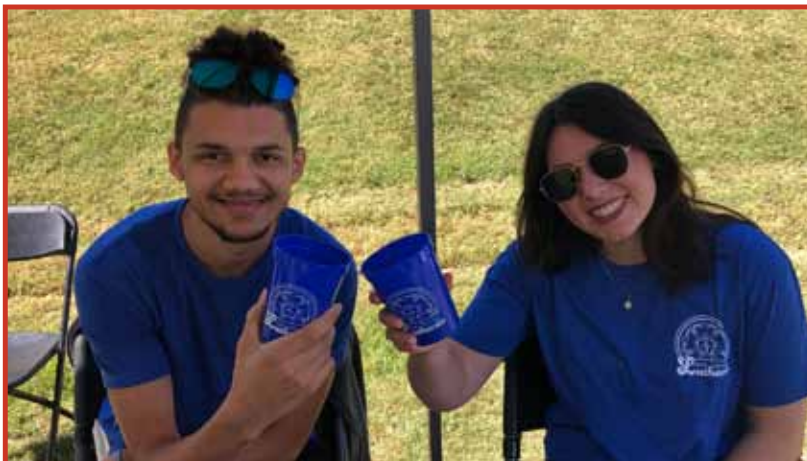
"Love Being Lutheran" was the theme of the day for t-shirts and beer cups, as modeled by two event volunteers and alum from Immanuel's school.