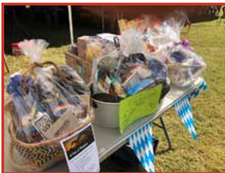
A live auction of themed baskets raised $1,200 for Restore Corps Memphis, a local non-profit that helps victims of human trafficking. Many thanks to the congregations and other organizations that donated baskets for the auction!