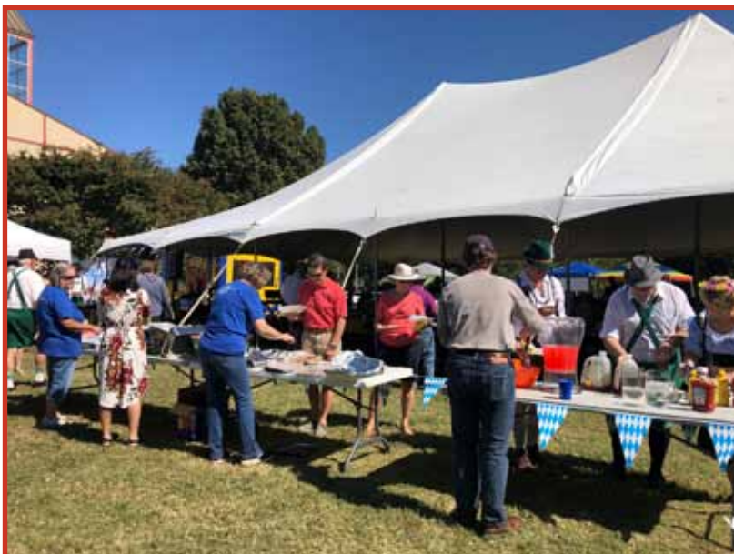
The weather was perfect for the multi-congregational celebration of Oktoberfest!