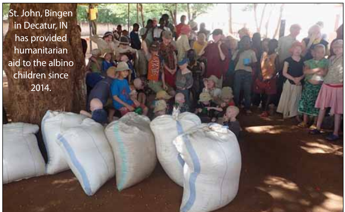
St. John, Bingen in Decatur, IN has provided humanitarian aid to the albino children since 2014.