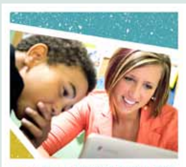
2017 NATIONAL LUTHERAN SCHOOLS WEEK

This month's Encourager features inspiring updates from our wonderful Lutheran schools. Across Arkansas, Tennessee and southern Kentucky, young minds are growing and lives are being touched by Christ through the impact of these amazing ministries.