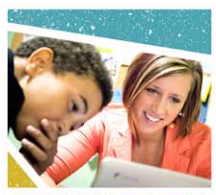
2017 NATIONAL LUTHERAN SCHOOLS WEEK

NATIONAL LUTHERAN SCHOOLS WEEK (January 22-28, 2017) provides our network of nearly 2,300 LCMS preschools, elementary schools and high schools with the public opportunity to proclaim and celebrate God's work among us in Lutheran schools. The Mid-South District has 25 preschool or early childhood centers. Of those 25, eleven have an elementary school and two of those schools have a high school.