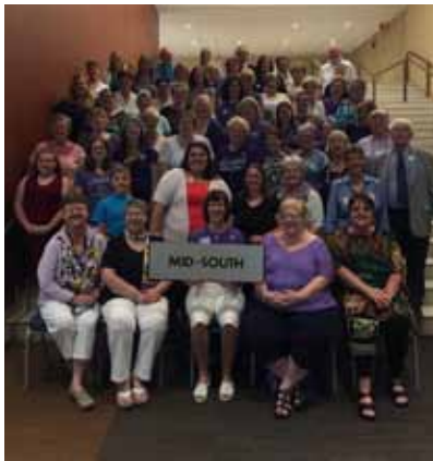
(Above) Attendees from the Mid-South District at the 37th Biennial LWML Convention in Albuquerque, NM, which took place June 22-25, 2017.