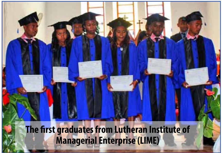
The first graduates from Lutheran Institute of Managerial Enterprise (LIME)