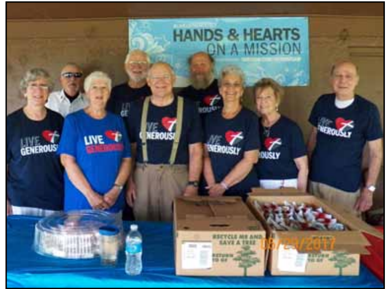
The Memorial Day Action Team

Besides a tremendous turnout on a beautiful day, there was the unexpected blessing that people stayed and visited in the park well over an hour after the service. It was great to see so many children with their parents in a time when so much of our past as a nation is being either removed or forgotten. The lunch helped bring a real sense of community to Horseshoe Bend and thank you letters have confirmed this. From the positive sense of service to the community, members of Shepherd of the Hills are planning to have a Memorial Day Action Team for 2018.