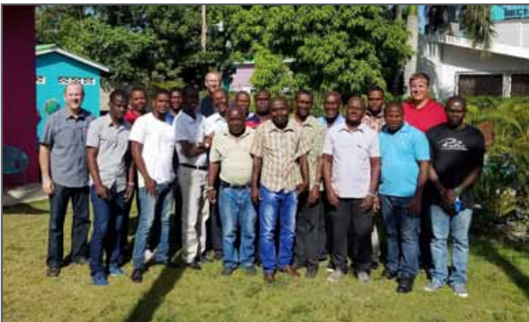
Our Feeding Program Administrators and Haitian Directors at the August Workshop Training in Haiti.

August is an important time for Trinity/HOPE. We started the month with a celebration event to recognize and honor our hard-working volunteers and supporters, quickly moved to our annual board meeting and then headed to Haiti where we hosted a three-day training workshop for all our Haitian Feeding Program Directors. The workshop allows us to prepare for the upcoming school year, teach new procedures, set goals and continue to develop our Haitian staff. It is a great time for our Feeding Program Administrators from the United States to build a stronger relationship with the Feeding Program Directors and unite our efforts to be good stewards of all God's blessings shared with the children in Haiti. To see these Godly men excited about their work and sharing God's love with the students, teachers, and cooks is energizing! This year we praise God that the program was extended to four more schools adding 750 meals bringing our daily total meals to 24,000! Please pray for all involved in this upcoming school year and that more hearts are moved to follow Jesus, and lives improved by the saving witness of the meal they receive each day.