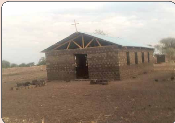
The land was purchased, cleared, foundation dug and bricks made - the church being built.