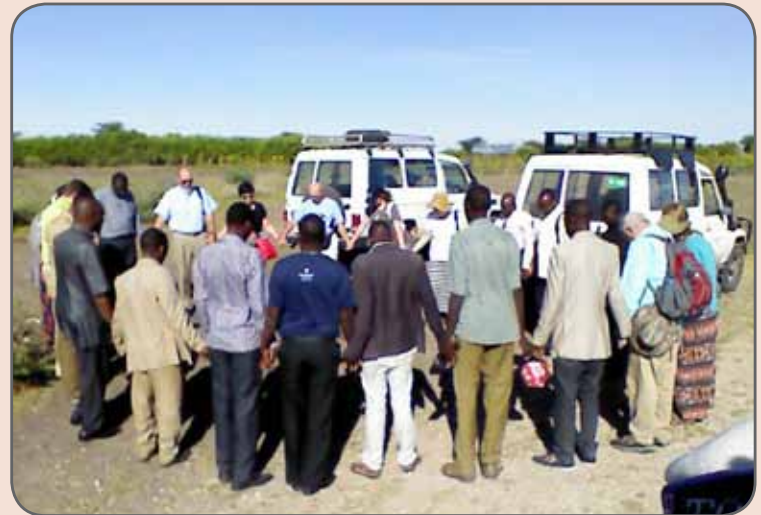
Group of believers praying for the land to be purchased and to build a church.