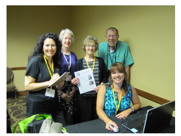
Pubicity Committee is hard at work on the next Hope Herald