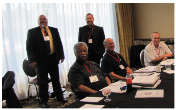
THE MISSION & MINISTRY FLOOR COMMITTEE PREPARES RESOLUTIONS (L).

A NUMBER OF OVERTURES WERE RECEIVED BY THE ADMINSTRATION AND FINANCE FLOOR COMMITTEE (R).