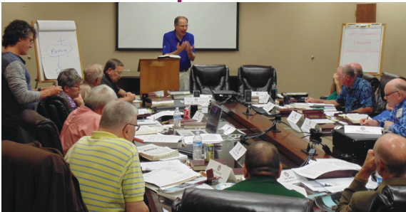
In June of 2017 the Mid-South District office hosted over 15 deacons for a special "colloquy intensive" course to instruct and prepare those who would seek to apply for admission to the pastoral ministry by colloquy.

"We are more than halfway through all the men who were faithfully, and with dedication, taking care of congregations as licensed lay deacons," he said. "Concerns that were raised for us were that there would be congregations that would ultimately end up closing because they did not have a qualified and ordained pastor, and that concern has been effectively addressed. There are no congregations that will have any difficulty because we have made the process so adaptable that everyone will continue to have Word and Sacrament ministry on a continuing basis because of this."