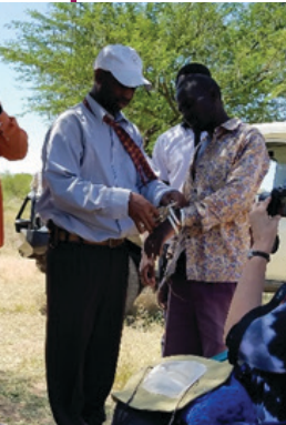
A town leader gives up his pagan charms.