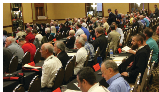
Delegates preparing to cast their votes.