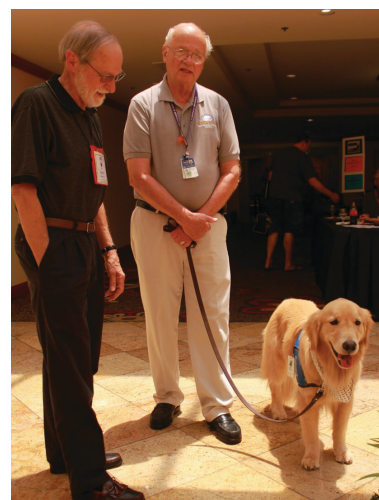
Everyone loves to visit with a Comfort Dog!