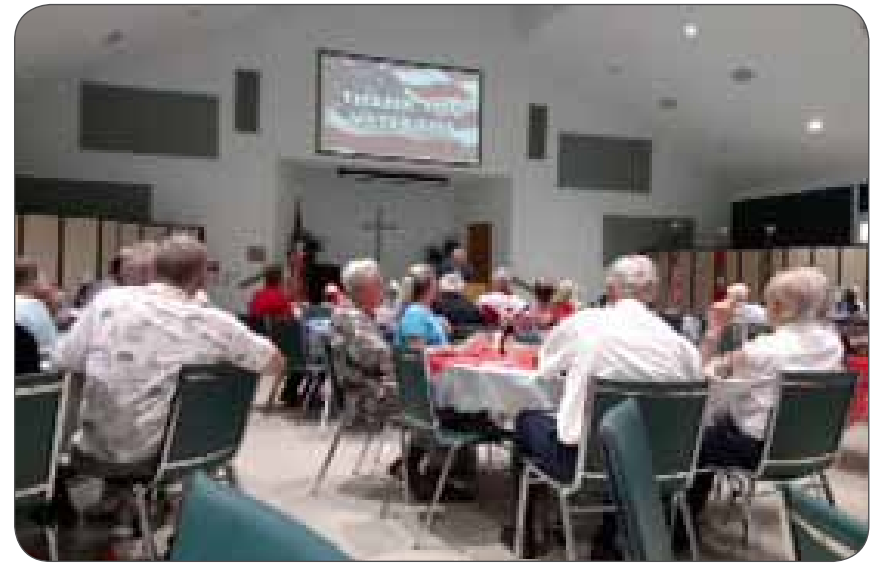
98 local veterans, including vets from WWII, Korea, Viet Nam, and representing all of branches of the service

On May 26, 2018 Christ Our Savior Lutheran Church in Loudon, TN hosted 98 local veterans, including vets from WWII, Korea, Viet Nam, and representing all of branches of the service for our sixth annual pancake, sausage, bacon, and scrambled egg breakfast. The program included a color guard to post the national, state, and POW colors, pledge of allegiance, slideshow of local vets in uniform (way back when), a guest speaker, and singing patriotic music. Fourteen volunteers did setup, decoration, food prep, audio-visual, support, and cleanup tasks. About half of the veterans participating were from outside our church.