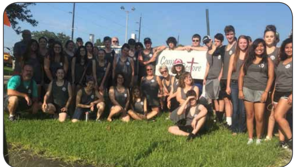
Camp Restore - New Orleans youth mission trip was (July 22-25) had 49 participants from 6 congregations across the Mid-South District.