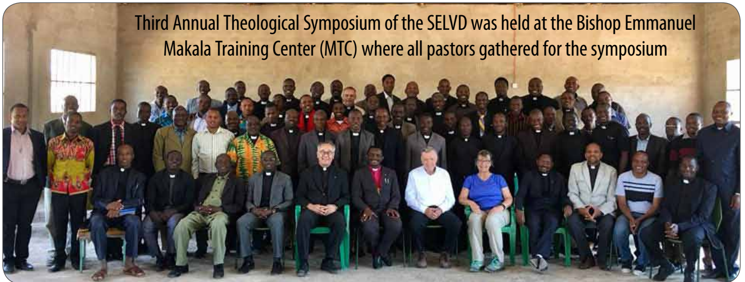
Third Annual Theological Symposium of the SELVD was held at the Bishop Emmanuel Makala Training Center (MTC) where all pastors gathered for the symposium