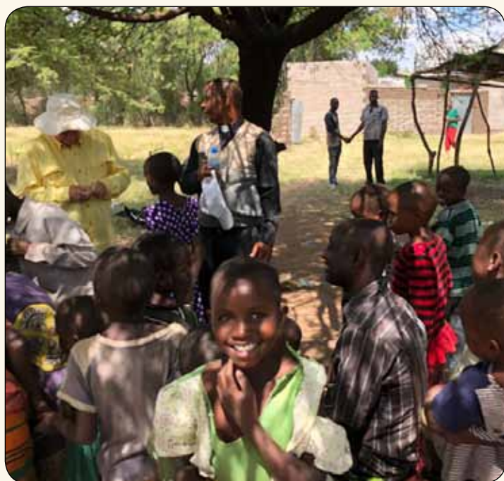
Worship time in the shade

The 2019 trip will again focus on outreach to the Sukuma tribe, in a group of villages, located in the South East Of Lake Victoria Diocese (SELVD).