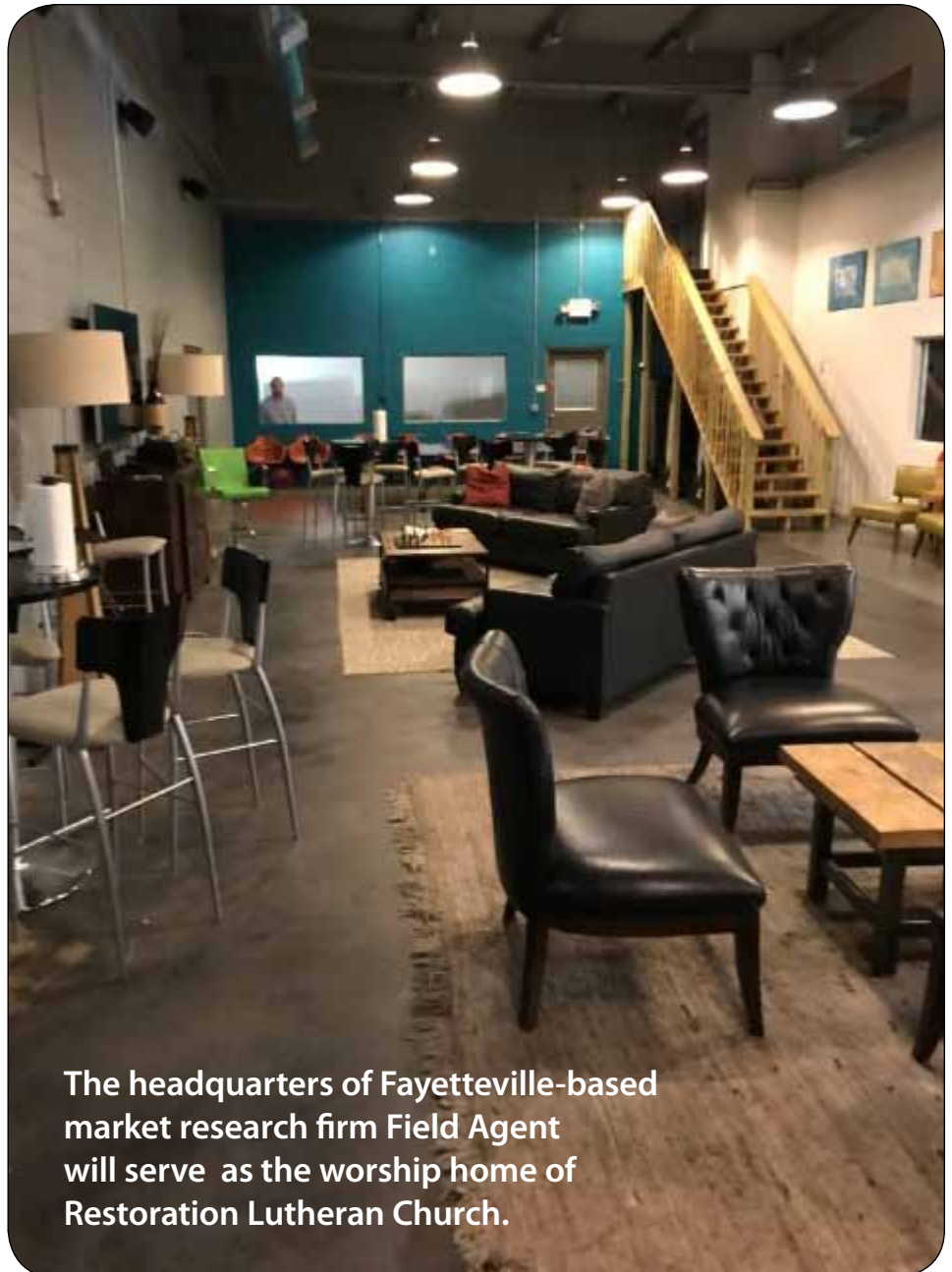
The headquarters of Fayetteville-based market research firm Field Agent will serve as the worship home of Restoration Lutheran Church.

Sign up to receive a weekly update from Restoration Lutheran Church at info@restorationlutheran.com . You can also follow them on Facebook (@Restoration Lutheran Church) or visit their website at restorationlutheran.com .