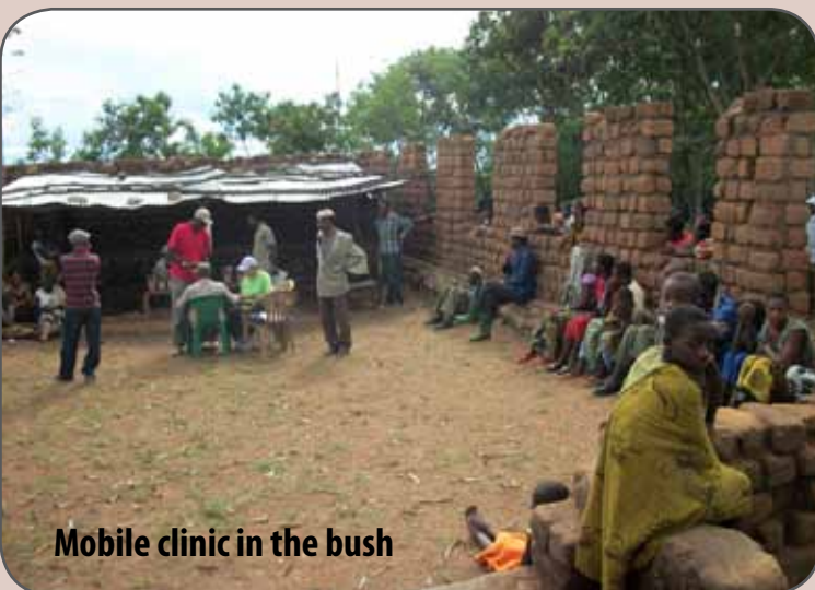
Mobile clinic in the bush