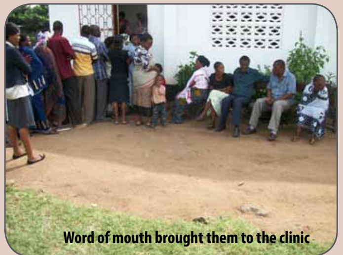
Word of mouth brought them to the clinic