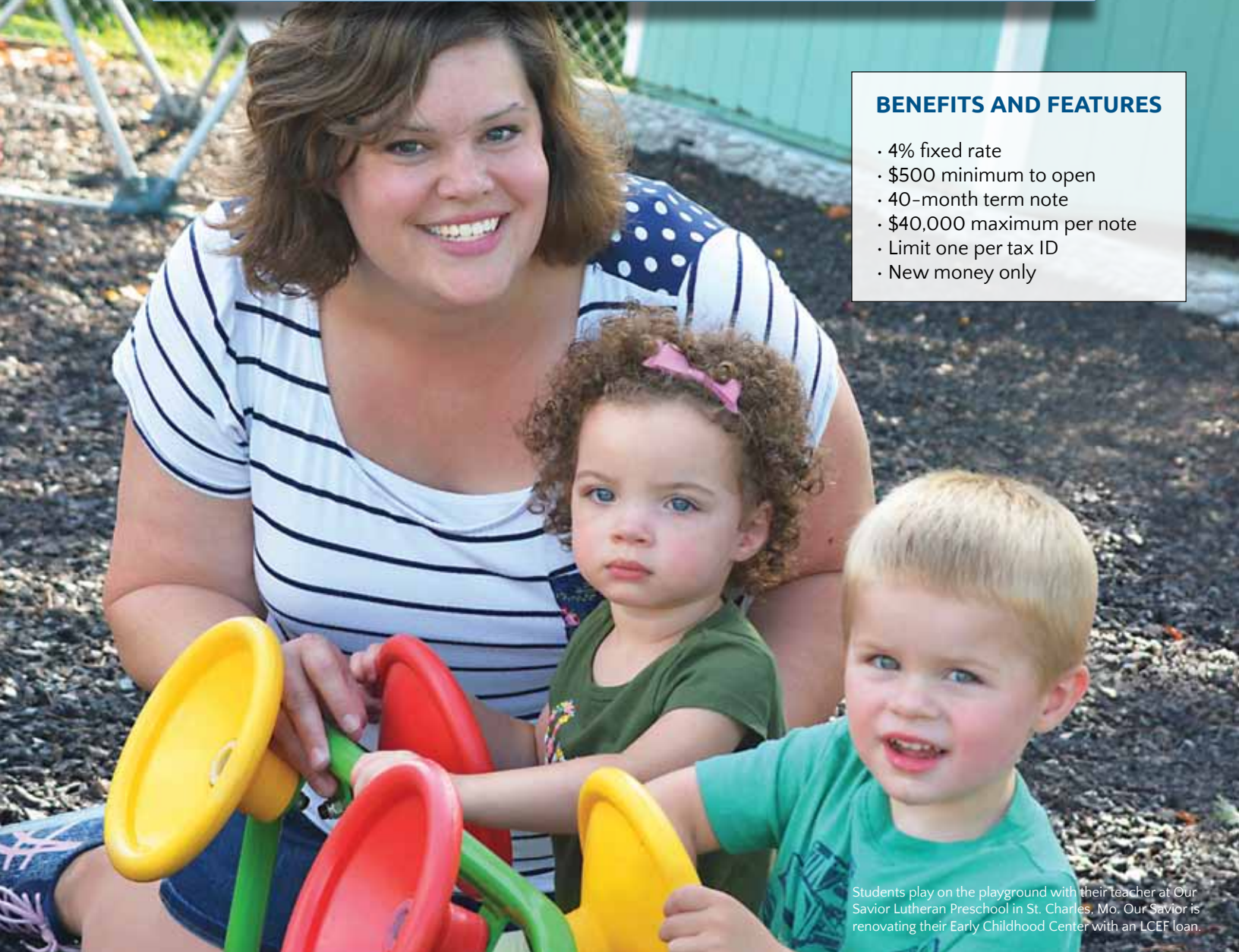
Students play on the playground with their teacher at Our Savior Lutheran Preschool in St. Charles, Mo. Our Savior is renovating their Early Childhood Center with an LCEF loan.