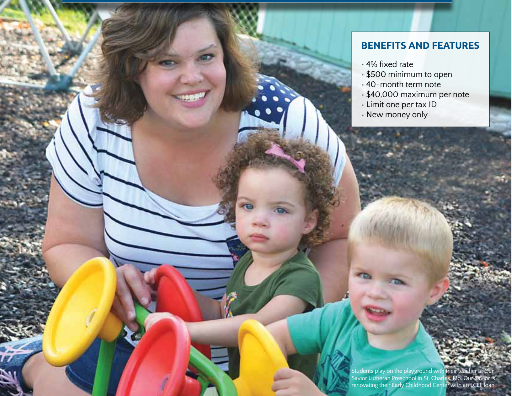
Students play on the playground with their teacher at Our Savior Lutheran Preschool in St. Charles, Mo. Our Savior is renovating their Early Childhood Center with an LCEF loan.