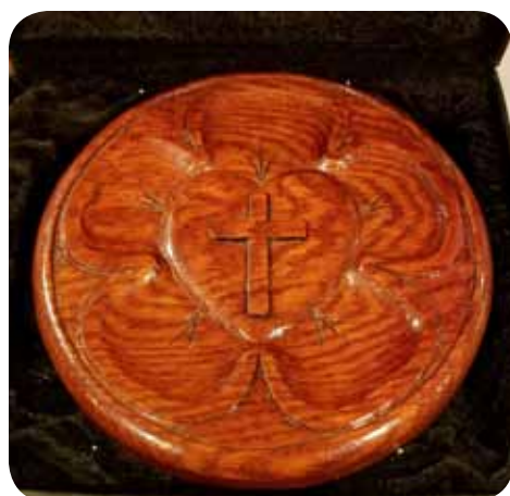
Hand carved Luther Rose