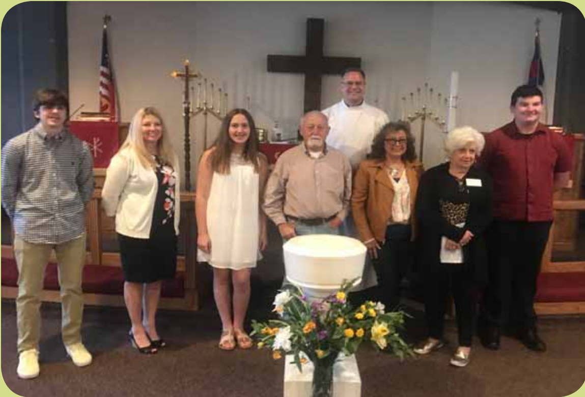
First Lutheran Church (Harrison, AR) welcomed 7 new members via confirmation class on April 14, 2019 and 1 by affirmation of faith (not pictured).