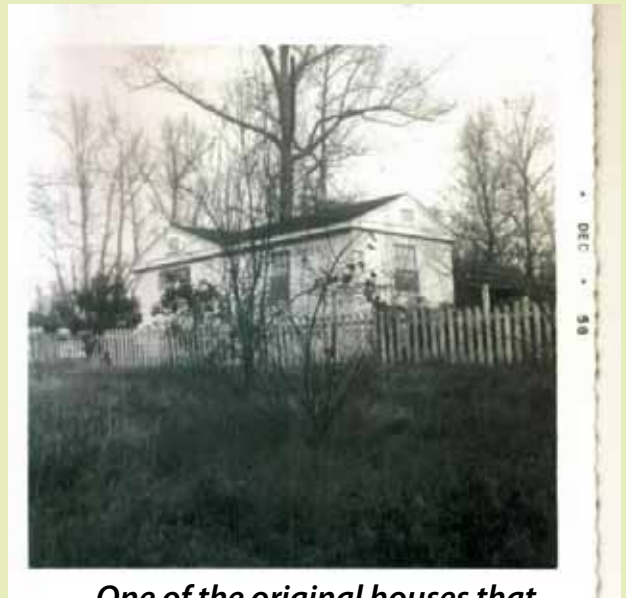
One of the original houses that served as the first sanctuary on the property at 5296 Park Avenue, surrounded by overgrown brush.