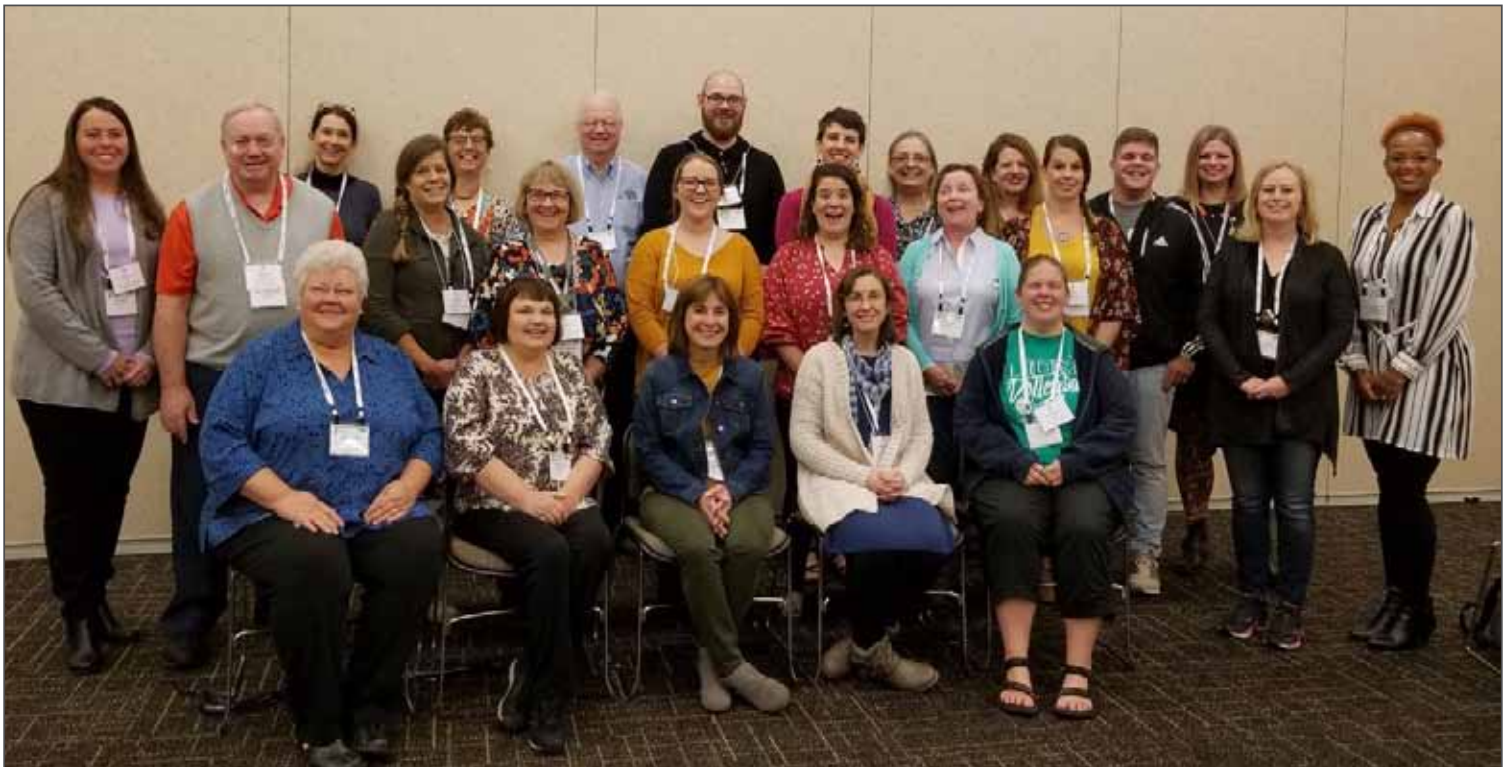
The Mid-South District was well represented at the recent Lutheran Education Association (LEA) convocation held in Saint Louis, MO. Both current and retired teachers from as far east as Knoxville, TN, central Memphis, and far west Fort Smith, AR had many opportunities to learn new ideas and skills.