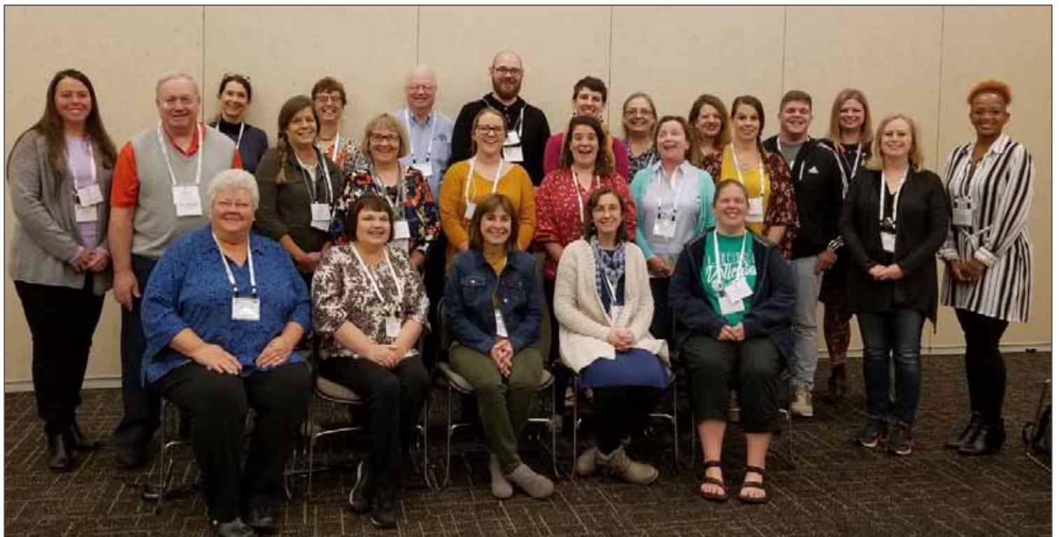
The Mid-South District was well represented at the recent Lutheran Education Association (LEA) convention held in Saint Louis, MO. Both current and retired teachers from as far east as Knoxville, TN, central Memphis, and far west Fort Smith, AR had many opportunities to learn new ideas and skills.