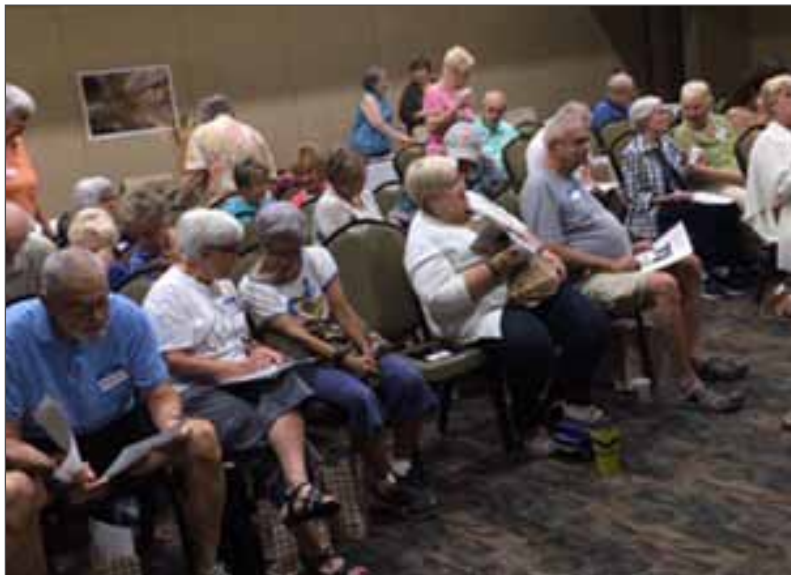
Attendees at Angel Workshop