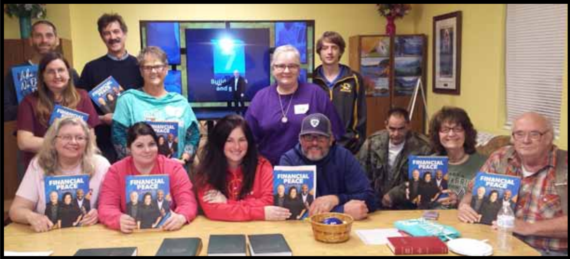
Congratulations to the first class of Financial Peace University at Peace, Cherokee Village, AR