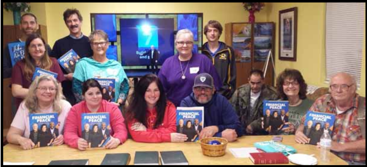
Congratulations to the first class of Financial Peace University at Peace, Cherokee Village, AR