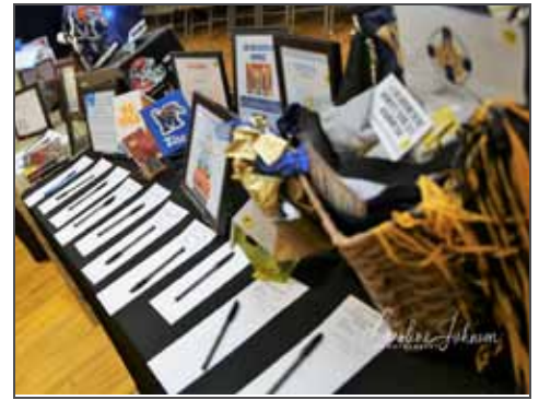
Over 150 items, including handmade items, gift cards, entertainment packages, and baskets galore, made for exciting bidding.