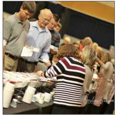
Members of CTK's Faith in Action committee serve up the chili from over 30 different recipes, including beef, chicken, and specialty.

The Chili Bowl and Silent Auction raised $6,078.42 for the Mandou School and Trinity HOPE. Thank you to everyone who participated!