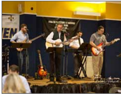
CTK's own "Beatles" provided musical entertainment for the event.