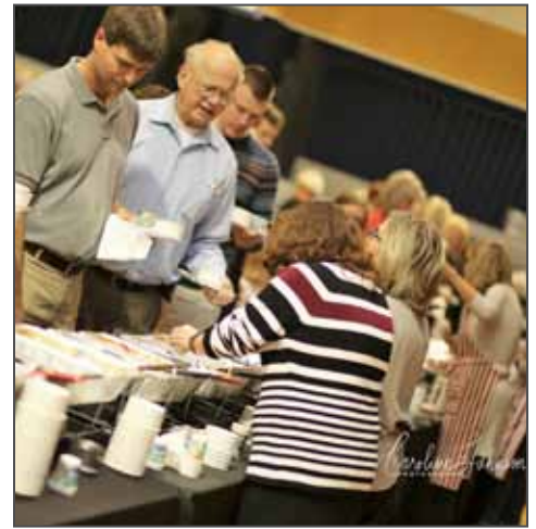
Members of CTK's Faith in Action committee serve up the chili from over 30 different recipes, including beef, chicken, and specialty.

The Chili Bowl and Silent Auction raised $6,078.42 for the Mandou School and Trinity HOPE. Thank you to everyone who participated!