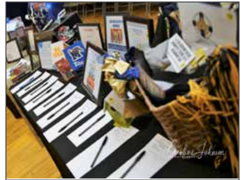
Over 150 items, including handmade items, gift cards, entertainment packages, and baskets galore, made for exciting bidding.