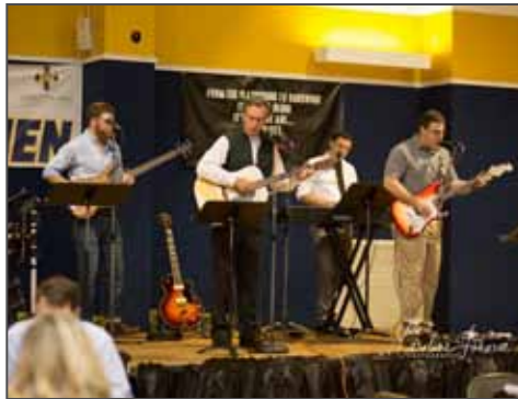
CTK's own "Beatles" provided musical entertainment for the event.