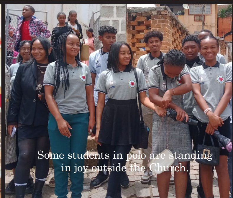
Some students in polo are standing in joy outside the Church.