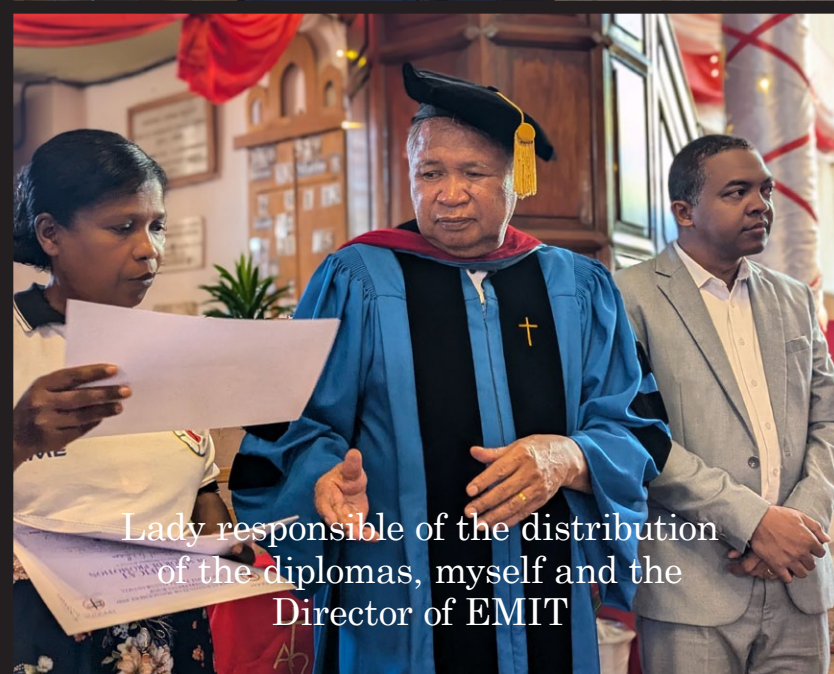
Lady responsible of the distribution of the diplomas, myself and the Director of EMIT