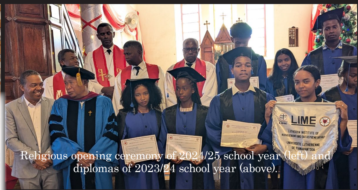
Religious opening ceremony of 2024/25 school year (left) and diplomas of 2023/24 school year (above).

The Lord be with you! Big thanks to Jesus Christ our Good Shepherd, the Head of the Church. Warm thanks to you, to your staff, to the Mid-South District and to your family.