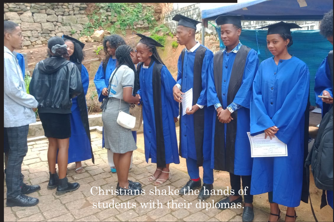
Christians shake the hands of students with their diplomas.