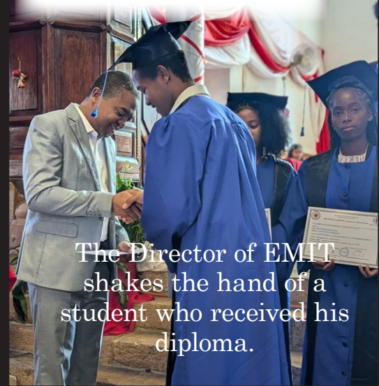
The Director of EMIT shakes the hand of a student who received his diploma.