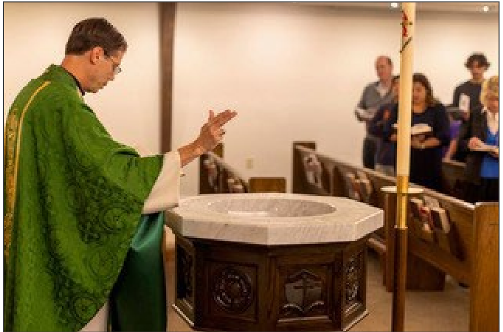
Blessing of Redeemer's new Baptismal Font on the Last Sunday of Church Year.