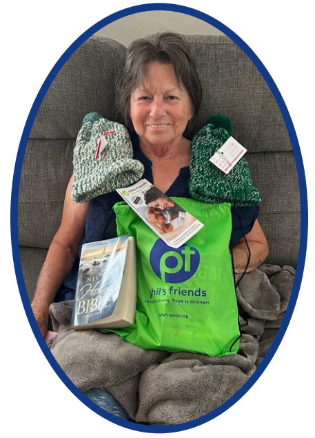
Care package recipient