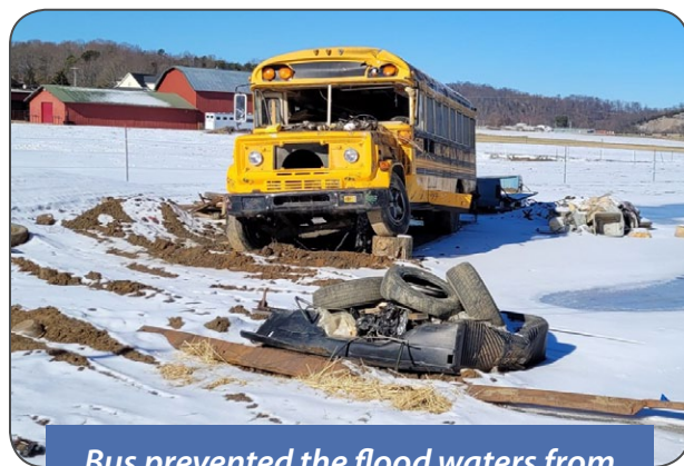
Bus prevented the flood waters from destroying the home